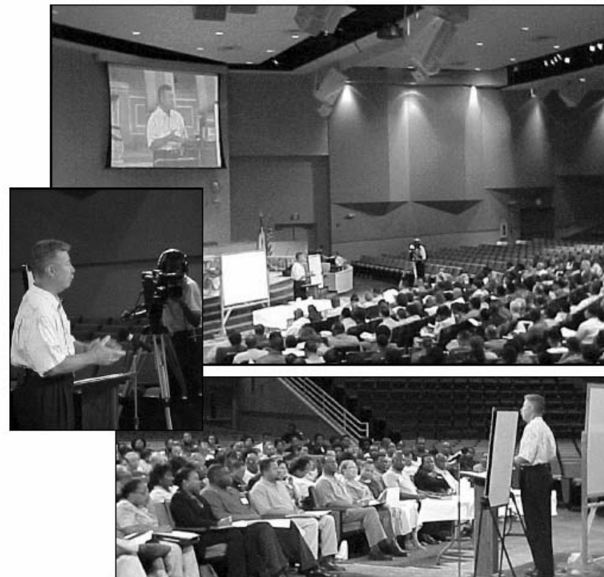
Surround yourself with leaders from across the nation and around the world who are committed to achieving their destiny.